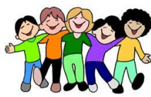
Friends of Runcton Holme School

The Breakfast Club is still open every day from 8am to 9am - spaces are always available. If your child requires a place, please book at the school office. 1 child £3.20, 2 children £5.00 and 3 children £6.40 per day, this includes breakfast and starts at 8:00am each day of the week.