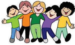
Friends of Runcton Holme School

WOW!!! Across the Holy Cross Federation, we raised a total of £70.80 Thank you everyone